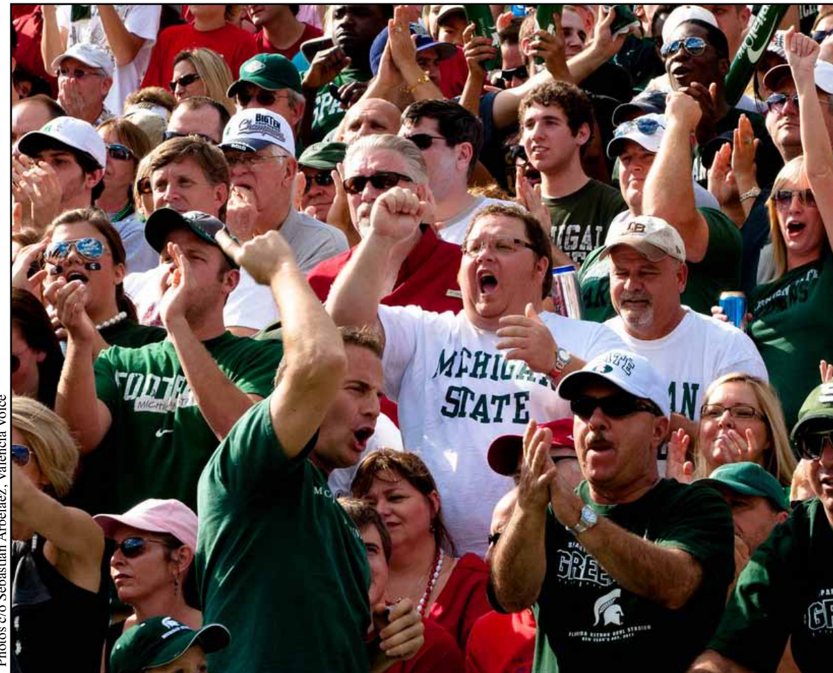
The new Florida Citrus Bowl is part of an expensive beautification project for the city of Orlando.

Consideration to overall area beautification could do just as much for the stadium's reputation as actual physical improvements to the facility itself. Hopefully in years to come planners and financiers will see the benefits an area wide makeover could bring to the city of Orlando's sports tourism industry as a whole.