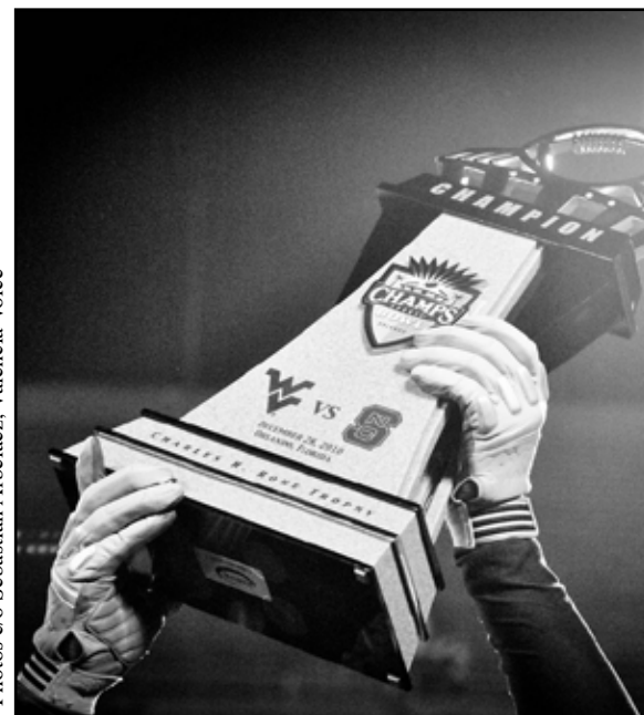
North Carolina Wolfpack beat the West Virginia Mountaineers with a score of 10-7.

Heading into spring ball and off-season conditioning, it would be a great morale boost for the Wolfpack to be once again ranked.