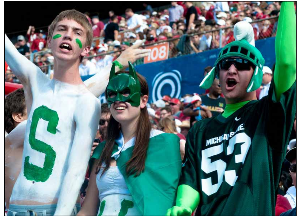
The Florida Citrus Bowl was built in 1936 and was designed to hold about 1,000 viewers. The new renovated stadium holds 70,000 fans, a necessary adjustment to hold bowl game fans.

Parramore, an area once noted for its high robbery and homicide rates, has made significant progress since 2008 when the number of murders totaled 123. Since, rates of robberies have dropped 41 percent while murders have gone down